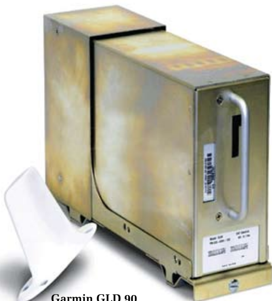
Garmin GLD 90 Data Link Sensor and GPS antenna.

There is considerable discussion (argument?) at the moment about ADS-B being extended to GA (General Aviation) aircraft; the most telling argument is the cost (around $10,000 plus installation) and annual maintenance for the private aircraft owner.