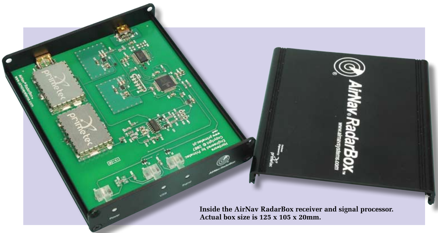
Inside the AirNav RadarBox receiver and signal processor. Actual box size is 125 x 105 x 20mm.

Impressed? We were! But how much more impressed would you be if we told you that you could do this from almost any location in the world?